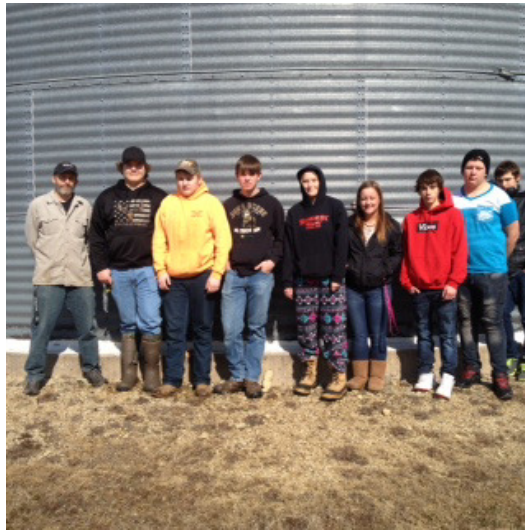
Houston High School Students